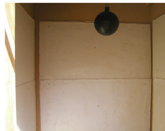
Fig. 3 View of wall boards with PCM

Experiment was successful because maximum daily temperatures in object with PCM were lower than in object without PCM. For example maximum daily temperature in object No. 1 (without PCM) was 36,1\text{ }^{\circ}\text{C} for day 10.9. and in object No. 2 there was maximum daily temperature 32,3\text{ }^{\circ}\text{C} . So the difference is 3,8\text{ }^{\circ}\text{C} . On the other side temperatures