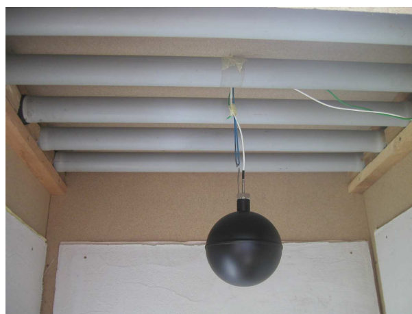
Fig. 2 View of tubes with the salt hydrate mixture

Aim of our research at Brno University of Technology was the verification of positive effect of the PCM on thermal stability in the buildings in the summer season. For this purpose we needed two identical experimental objects for verification of behaviour of PCM. For the verification of the properties of the PCMs salt hydrates were erected two identical experimental objects in village Vrtežir situated west from Brno. Each of them has composition of the envelopes from light-weight materials. In each object was in the external wall installed single glazed window. As phase change material was used salt mixture on the base calcium chloride hexahydrate in object No. 1. We installed PVC tubes filled in salt mixture in object No. 2. We situated 6 tubes with diameter 63 mm under the ceiling. The length of each tube was 1,0 m. Each end of the tubes was closed by PVC plug. There was a space for flowing of indoor air between tubes and ceiling. On the picture (Fig. 2) there is a view of tubes with PCM. Last year instead of the tubes with PCM we used boards from gypsum plaster with encapsulated PCM (Fig. 3).